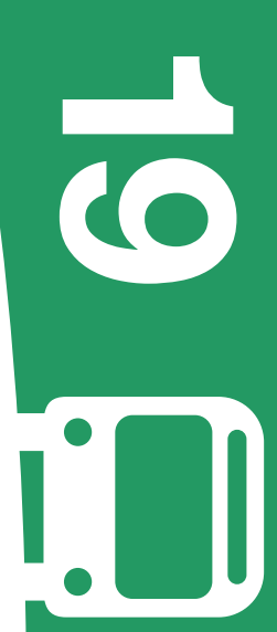
Timetable & Map